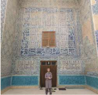
See beautifully decorated mosques