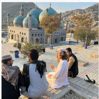
Enjoy the sunset with tea from Sakhi Shrine