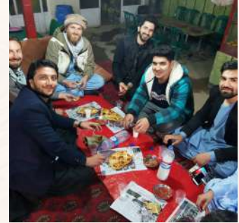
Eat delicious afghan food and meet locals