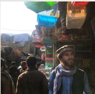
Visit the Ka Feroshi Bird Market in Kabul