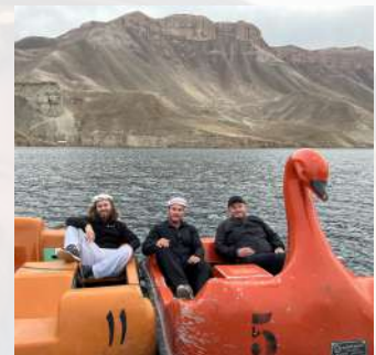
Go for a duck boat ride in Band e-Amir