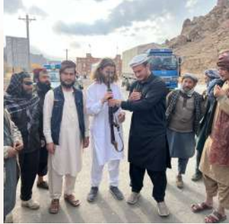
Possible photo ops with t-ban soldiers