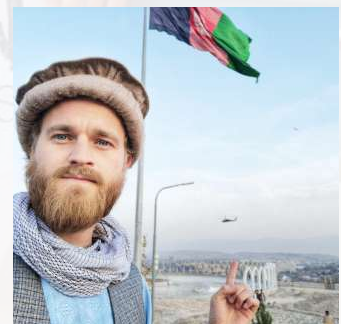
See the view over Kabul from pool hill