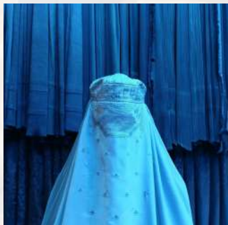
Try on a burqa in a local clothing store