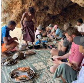
Lunch and a guided tour by "the Caveman"