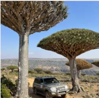
Visit the Dragon Blood Tree Forest