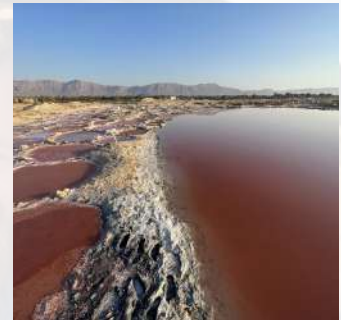
Stop by the "pink" salt lake