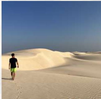
Walk through the white sand dunes