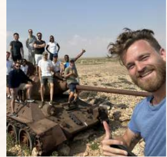
Photo stops by old soviet tanks