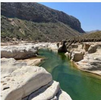
Swim in the Killisan natural pools