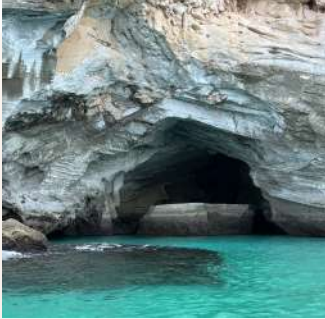
See the coastal landscape by boat