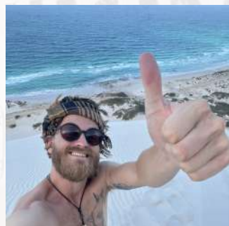
Free time at beautiful white sandy beaches