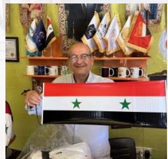
Meet friendly locals