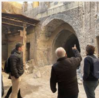
Walk around the old souq in Aleppo