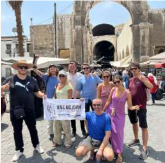
Explore the old town of Damascus