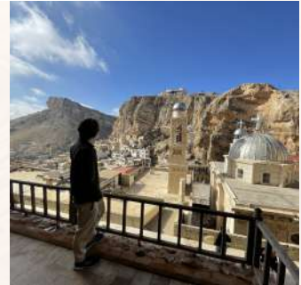
Visit the christian town called Maloula