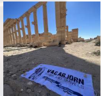
Visit the ancient Roamn city Palmyra