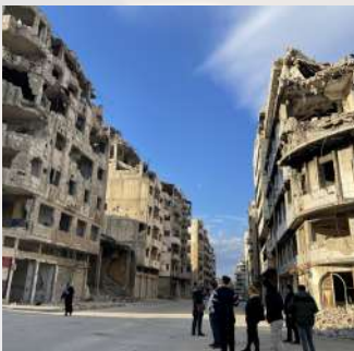
Visit the destroyed areas of Homs