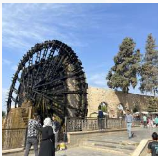
See the water wheels of Hama