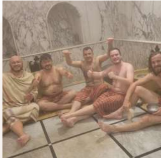
Try an included hamam experience