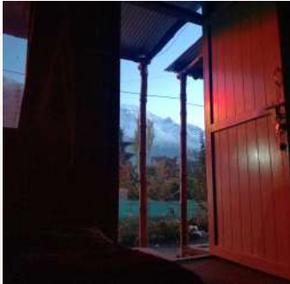
Sleep in some simple, yet charming places