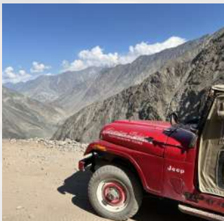
Take a crazy ride in an old school Jeep