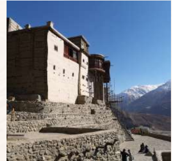
See Altit and Baltit Fort