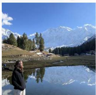
Visit Fairy Meadows