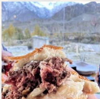
Try a Yak burger made from Yak meat