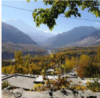
Stay in Hunza Valley