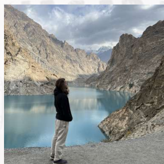
Stop for pictures at Attabad Lake