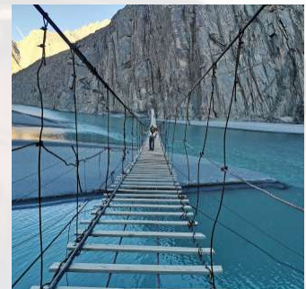
Walk across Husseini and Passu Bridge