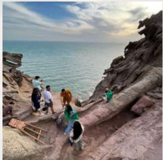
Visit the sunset abyss