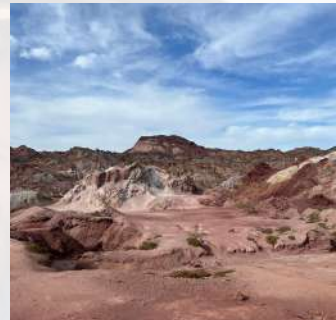
Walk around rainbow valley