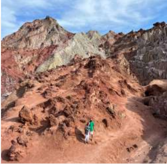
Visit the salt mountain