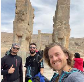
Visit the archeological site of Persepolis