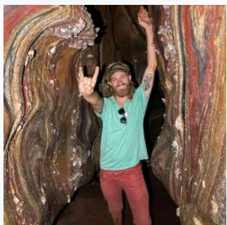
See the multi colored cave