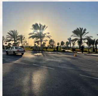
Walk the corniche of Bandar Abbas