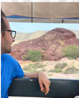
Ride a Tuk Tuk around the island