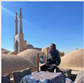
Dine at rooftop cafés in Yazd