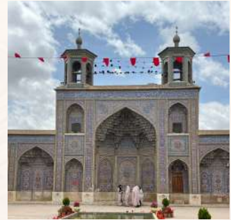
Visit the Pink Mosque in Shiraz