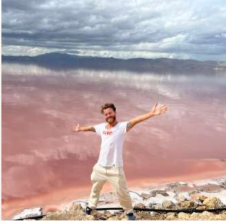
Visit the pink lake outside Shiraz