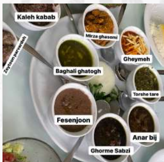
Eat your way through the Iranian cuisine