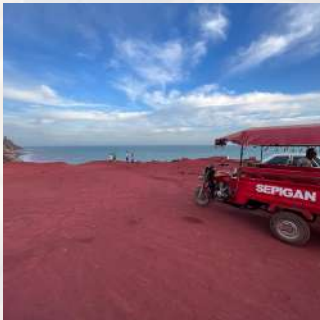
Visit the red beach