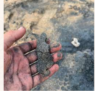
Visit silver beach