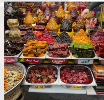
Taste amazing Iranian sweets