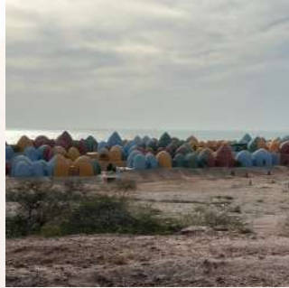
Visit the colorful Majara residence