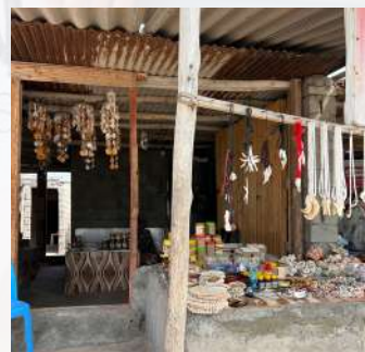
Visit local markets with authentic souvenirs