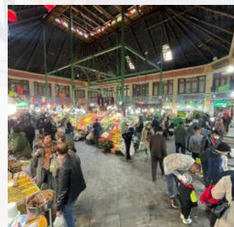
Visit traditional markets